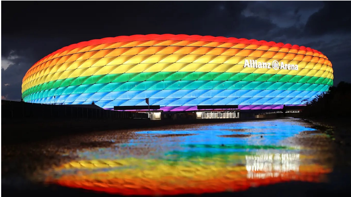
Figure 1. The Allianz Arena in Munich, Germany. The arena has been the home arena of the German soccer club 1. FC Bayern München since the 2005/2006 season. During the UEFA Euro 2020, the arena was the venue for a total of 4 matches (3 preliminary round matches, 1 quarterfinals) as well as the home stadium of the German national team (Group F). The illustration here shows the Allianz Arena in rainbow colors. The picture was taken during the Christopher Street Day 2020 (parades and official events were cancelled due to COVID-19). The arena was not allowed to be illuminated in these colors during the UEFA Euro.