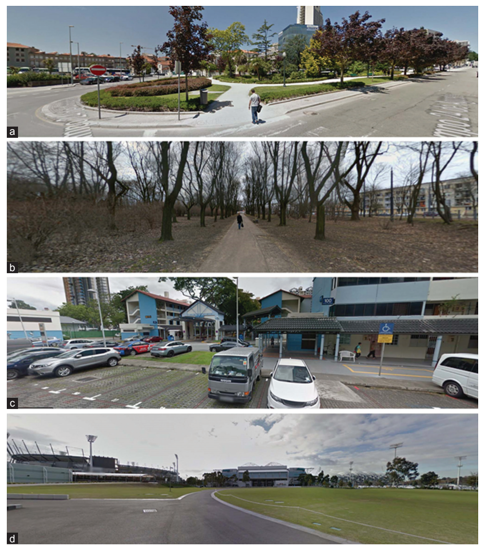
Figure 2; Examples of different types of green open spaces that are not "that green." (a) Jardim do Campo 24 Agosto, Porto, Portugal; (b) Praski Park, Warsaw, Poland; (c) Green parking lot, Toa Payoh, Singapore, (d) Olympic Park, Melbourne, Australia.

change in urban health initiatives with a strong focus on the creation, promotion, and maintenance of green spaces, with an explicit call for expert advice<sup>[40]</sup>.