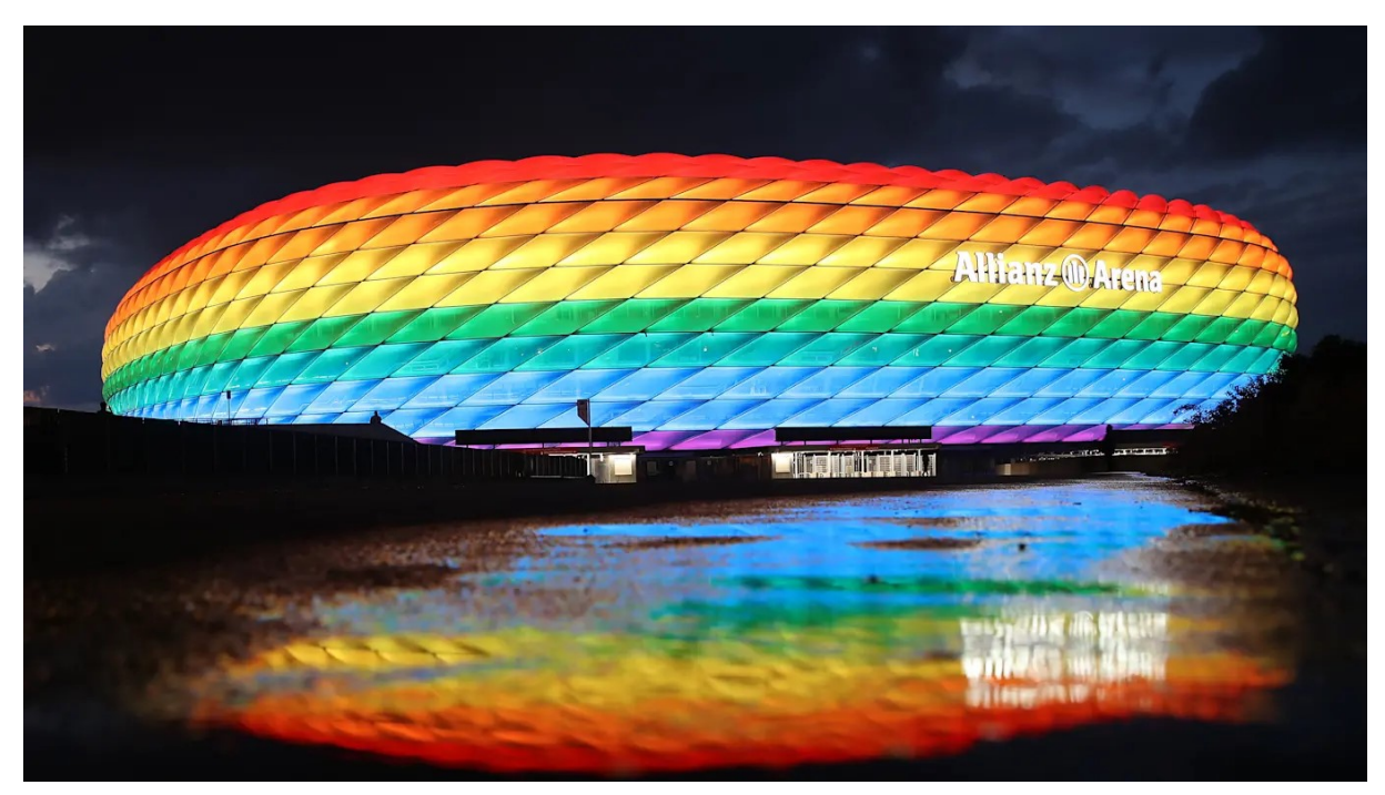
Figure 1. The Allianz Arena in Munich, Germany. The arena has been the home arena of the German soccer club 1. FC Bayern München since the 2005/2006 season. During the UEFA Euro 2020, the arena was the venue for a total of 4 matches (3 preliminary round matches, 1 quarterfinals) as well as the home stadium of the German national team (Group F). The illustration here shows the Allianz Arena in rainbow colors. The picture was taken during the Christopher Street Day 2020 (parades and official events were cancelled due to COVID-19). The arena was not allowed to be illuminated in these colors during the UEFA Euro.